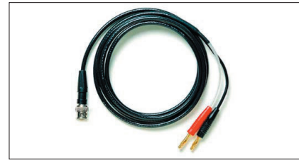
EC04 BNC to 4 mm Banana Plug Cable