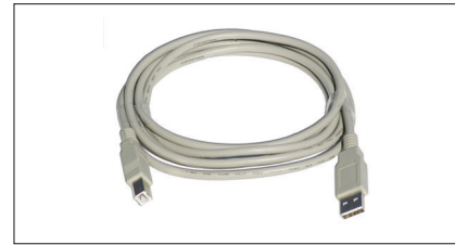
EC405 USB Cable

A USB Cable (Type AB) supplied with all e-corders , for connection to a computer USB socket. .