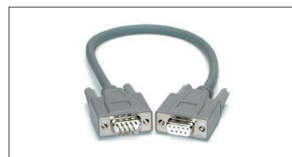
EC02 DB9M to DB9F Cable