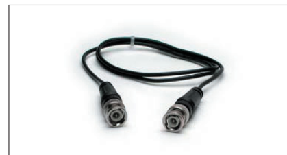
EC01 BNC to BNC Cables (1 m) (5 pack)

A pack of five fully moulded BNC to BNC cables. For connecting eDAQ Amps or other devices with a BNC output to an e-corder unit.