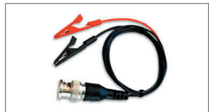
EC08 BNC to Pair of Alligator Clips