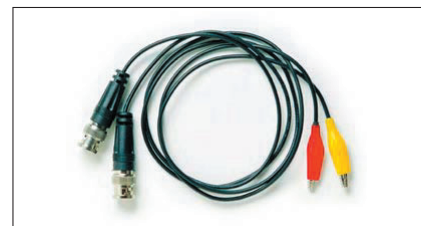
EC07 BNC to Alligator Clip Cable