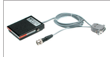
EC91 Foot Switch

The foot switch is used as a triggering device. The switch has an open contact and when depressed, gives a TTL output. It can be connected to either the trigger input of the e-corder to provide triggering signals, or one of the channel inputs for comment insertion.