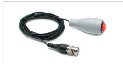
EC92 Push Button Switch

The Push Button Switch provides a 6 V output for triggering, timing or marker signals. It can be connected to either the trigger input of the e-corder or one of the input channels.